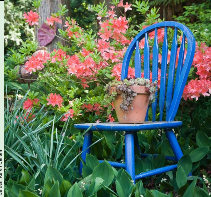
Garden: Karen Gilliam

Programs cover an extensive range of gardening related topics from beginning to expert: fundamentals (helping plants thrive, controlling weeds, pruning methods, soil conditioning), design (creating a beautiful garden, determining appropriate plants), specific plants (peonies, irises, rhododendrons, fuchsias, etc.), animals (mason bees, chickens), tourism (English gardens), and community involvement (Food Bank assistance, horticultural therapy, safe landscaping). These are just a sample!