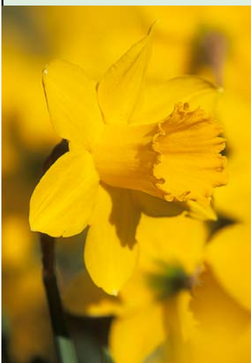
Garden: Ira Penn

Please make checks payable and send to: Birchwood Garden Club PO Box 362, Bellingham, WA 98227-0362