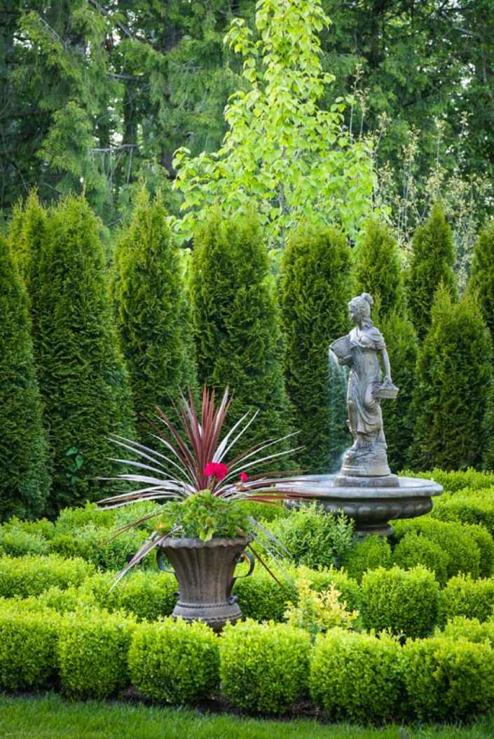
Garden: Judy Boxx • Front Garden: Natalie McClendon

No two gardens are the same. No two days are the same in one garden.